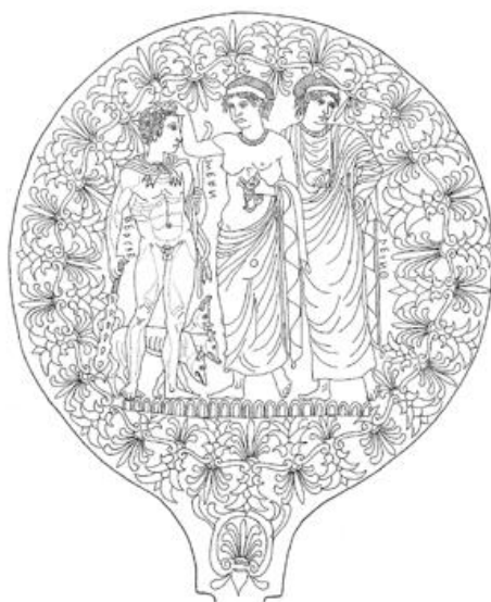
Figure 5. Mirror depicting Hercle with Kerberos in the background (left), Mean (middle), and Leinth (right).