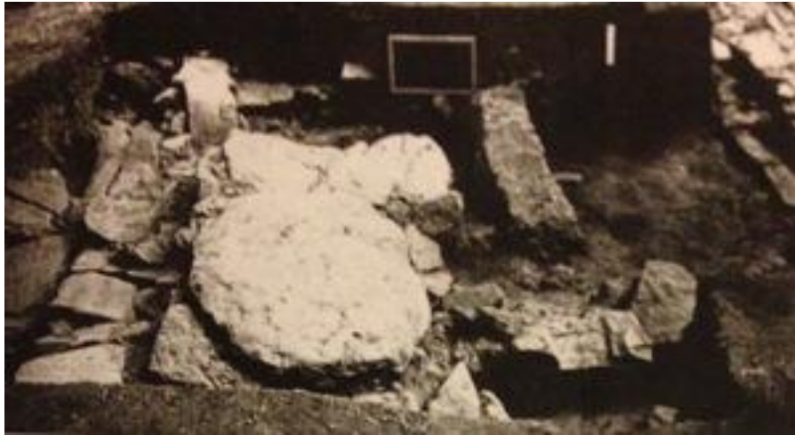
Figure 4. Structure K with large, flat rock serving as ritual covering.

Within the context of the sanctuary at Cetamura, references to two specific gods, Lur and Leinth, have appeared in inscriptions found about 2 m north of Structure K. 12 Lur is a minor god of a funerary nature whose various references indicate that he functions both oracularly and protectively. 13 References to Leinth have only previously occurred as designs on the back of mirrors, but may function as a god of fortune in this context. A mirror from Perugia depicts Leinth alongside Hercle, the Etruscan assimilation of Herakles, and the goddess of victory Mean (Figure 5). Other mirrors show Leinth in scenes related to life and death, showing that this god is also funerary in nature. 14 Although there is no explicit connection between the inscriptions and Structure K, the depiction of Leinth alongside the heroic figure Hercle and a goddess of victory strongly implies that it had a connection with fortune. In the context of firing ceramics, good fortune is essential in having a successful firing, and it makes clear sense to appease a god who controls the fortune or outcome of events.