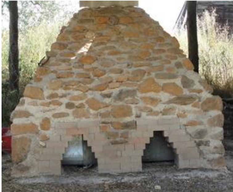
Figure 3. View of Professor Davis' reconstruction of Structure K from side with praefurnia .