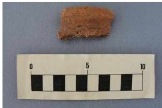
Figure 7. Example of CF 2 rim, find C-97-30, front.

The next most abundant type of ware is CF 2 with a total of 30 diagnostic shards. CF 2 is a rough and unrefined fabric used mainly for cookware characterized by its deep red paste and large sandstone inclusions (Figure 7).