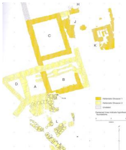
Figure I. A map of the artisans' zone and sanctuary complex located on Zone II. Structure K is located in the northeastern corner of this map, denoted by the letter K (K) (Source: Nancy de Grummond, The Sanctuary of the Etruscan Artisans at Cetamura del Chianti: The Legacy of Alvaro Tracchi , Florence, 2009).

The site itself consists of two separate self-contained areas separated by a steep escarpment. Zone I, the acropolis, and Zone II, located down-slope from Zone I, where the sanctuary and artisan's quarter is located as well as numerous instances ritual religious contexts. 4 One of these contexts is the space within the kiln itself (Structure K of Phase I), where there is evidence of rituals having been executed (Figure 1). The purpose of this research is to understand the nature of the rituals having taken place in accordance with the context of the crafting and firing of ceramics through the examination of artifacts, mostly shards of utilitarian wares, left within the kiln. Groups of shards are related through the context of the strata from which they were extracted. From this context one can understand the findings' temporal relationship with the site as a whole, and thence understand their historical and cultural significance.