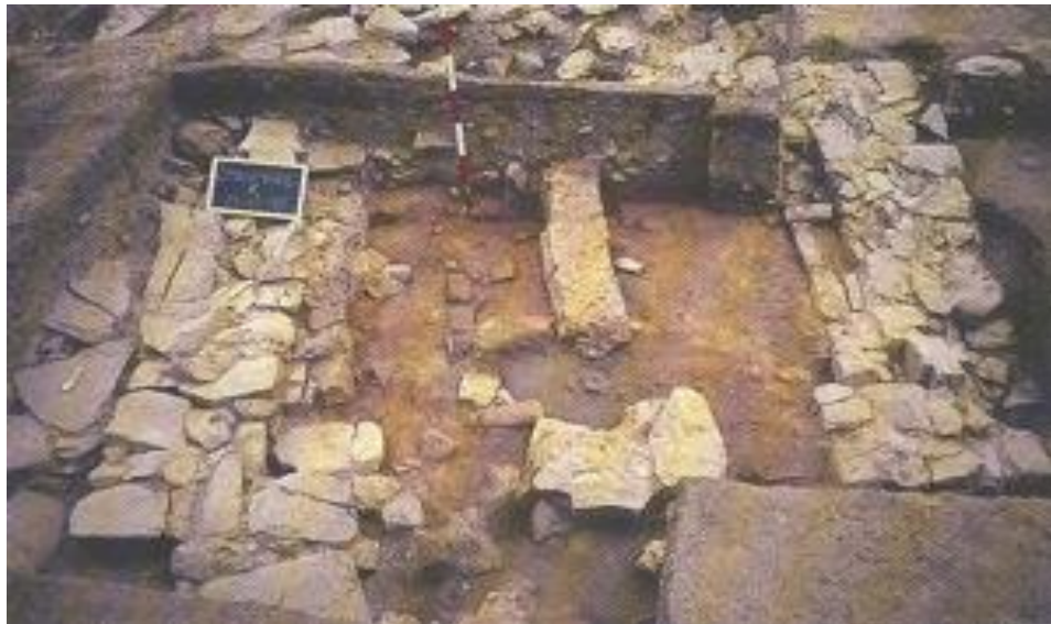
Figure 2. Structure K in excavation. The central mastio and the walls and their dimensions are apparent, revealing the size and shape of the kiln. The photo was taken after the removal of the mastini .

The height of Structure K is preserved to about 1.25 m with the south interior corner of the west wall resting on bedrock. Although the precise form and height of the superstructure is unclear, evidence of the corbelled praeurnia openings in addition to the remains of the south wall indicate that the roof was likewise corbelled and constructed from overlapping stones, brick and tile fragments, and large pieces of dolio . 9 From these findings Don Davis, professor of ceramics at East Tennessee State University, built a full-scale replica of the conjectured superstructure of Structure K using modern techniques and materials to attempt experimental firings so that the process could be better understood, allowing individuals to understand the physical structure of the kiln three-dimensionally (Figures 3).