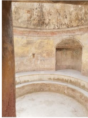
(fig. 11) Caldarium, Pompeii Bathhouse.

The male sections are larger than the spaces allotted for the women, yet each section was equally decorated with lavish art. Although most of the original decoration is almost impossible to see today, enough remains to support evidence of highly decorative and detailed artistic works inside.