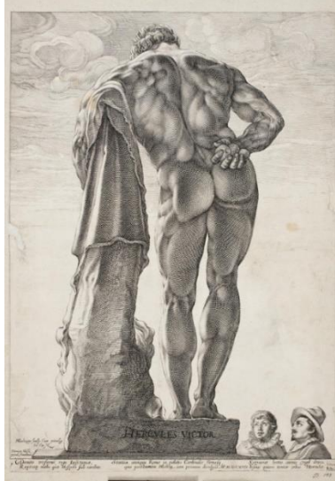
(fig. 6) Hercules Farnese, Baths of Caracalla. Goltzius, Hendrick. Engraving. https://www.jstor.org/stable/community.18658366

The Hercules Farnese is carved in the round to give the viewer an opportunity to fully experience this sculpture, further adding to the immersive qualities that already incorporated, offering a 360-degree view of him. The apples that he obtained can be seen in his hand that is behind his back, obscuring the frontal view of the golden apple. The hero is shown bearing his weight on a wooden club that is draped in the fur of the Lion of Nemean, from the kill of his first labor that now provides a cushion for his arm and weary body. After Hercules completed all twelve labors, he was considered Greece's most admirable hero for his strength and perseverance and was the perfect embodiment of the Greek idea called Pathos , the experience of virtuous struggle and suffering which would lead to fame and sometimes, as in this case, immortality. These attributes give emphasis to why this particular representation is replicated.