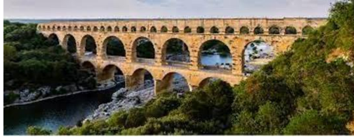
Fig. 2 Roman aqueduct system. Marcus Agrippa. Pont Du Gard. 1st century AD, 160 feet high. Yellow Limestone.

The first aqueduct in Rome was built by Appius Claudius, who was a Roman censor before engaging in one of the city's most valuable and historically significant inventions in engineering. After the major success of the first aqueduct, seven or eight more were built to supply water to Rome from many miles away, in such abundance that no city was better supplied. 11 Roman engineers used gravity and the aqueduct systems relied on an average slope of 0.20 percent incline to transfer the water to the city without manual labor. 12 This slope helped regulate water speed and was critical because, if the aqueducts were too steep, the fast water flow would cause damage to the building materials and degrade them over time. If the slope was not steep enough, the slow water flow would lack the speed to make it past the siphons. 13 The improvements made on the Roman aqueduct system was a highly influential component in the rising popularity of bathhouses in Italy during this time.