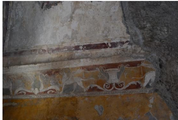
(fig. 8) Wall Fresco, caldarium, Pompeii Bathhouse.

Architectural elements with a specific decorative function were made of high-quality grey tuff that was quarried regionally in the Sarno River plain. 52 This artistic importance placed on functional decoration can be seen in the elaborate wall frescoes that are featured throughout the inside of the bathhouse along with the architect's specific attention to design to protect the wall art from any damages. The architect, Vitruvius, describes the elaborate methods employed by wall painters, including the insertion of sheets of lead in the wall to prevent the capillary action of moisture from attacking the fresco (Fig. 8), the preparation of as many as seven layers of plaster on the wall, and the use of marble powder in the top layers to help produce a mirror-like sheen on the surface. 53