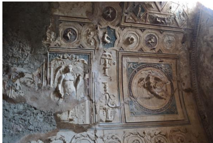
(fig. 9) Wall Reliefs, caldarium, Pompeii Bathhouse.

Other decorative elements, found in the interior of the bathhouse on the ceilings and walls of the domes incorporate low relief sculpture, further supporting the importance of art within the bathhouses at Pompeii. When entering the main room of the bathhouse, one can readily identify the multitude of artistic elements found ranging in the form of standing sculptures, wall art, and frescoes that were highly decorative in nature (Fig. 9).