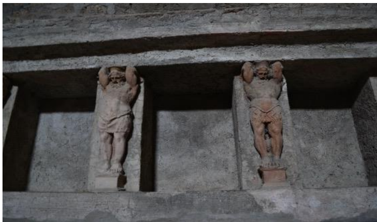
(fig. 7) Statue niches, caldarium, Pompeii Bathhouse.

The first and oldest of the three baths is the Stabian Baths, dating to the third century, considered the earliest example of public-bath architecture found in Italy. 50 The Stabian Baths stood at the intersection of the two main streets that quartered the city and included a small palestra as well as rooms for exercise and other recreational purposes. This bathhouse featured five entrance doors to the men's and women's sections with large niches in the six bathing rooms for sculptural pieces to go inside for decoration (Fig. 7). 51