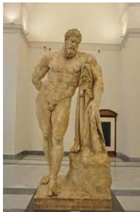
(fig. 4) Hercules Farnese , Baths of Caracalla. Lysippos. 3rd century B.C.E. 10.5 feet. Marble.

Pope Paul III Farnese was seeking decoration for both his private collection and for the Vatican when he spear-headed the Farnese excavations at the Baths of Caracalla starting in the summer of 1545 through the spring of 1549. 35 The Hercules Farnese (Fig 4.) and the Farnese Bull (Fig. 5) two of the major colossal statues to be excavated during this time, were highly significant since they revealed a key artistic component that added to the experience of the bather in a more interactive way.