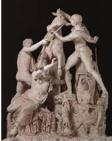
(fig. 5) Farnese Bull , Baths of Caracalla. Lysippos. Farnese Bull. 3rd century B.C.E. 22.5 inches tall. Marble. https://archaeology-travel.com/artefacts/farnese-bull-naples/

These two sculpture pieces are the only securely documented works from the excavation of the Baths of Caracalla. These statues would have been found in the frigidarium which is a very large room allowing enough space for such colossal statues.