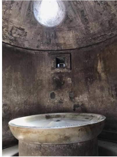
(fig. 10) Basin and Oculus, Pompeii Bathhouse.

Featured in the center of the domed ceiling inside the caldarium is a basin that measures nearly thirteen feet in diameter (Fig. 10), illuminated naturally by the oculus directly above.