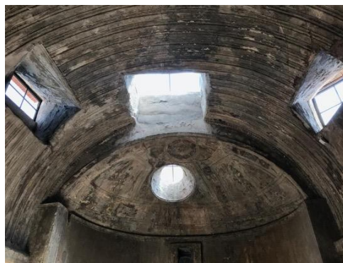
(fig. 3) Roman oculus and windows, Pompeii Bath House.

One element that was specifically built to capture and enhance natural daylight was the construction of the oculus (Fig. 3).