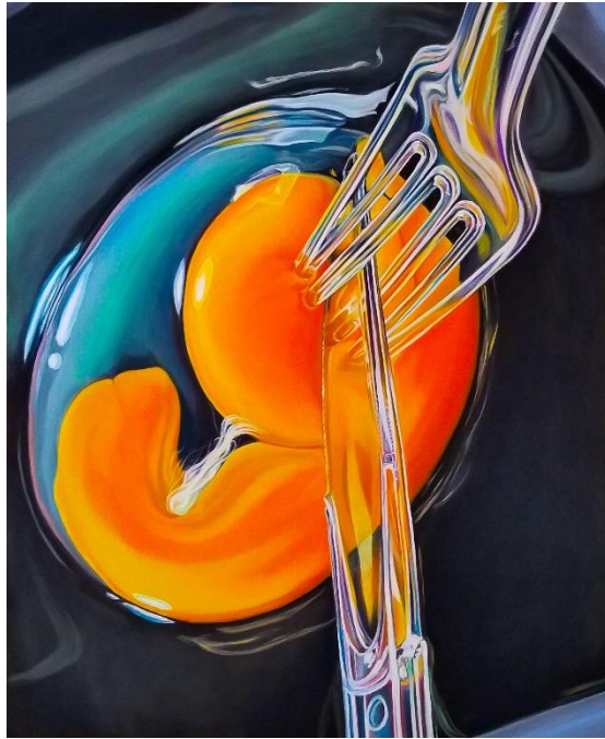
Will You Cut That Up for Her , Isabella Losskarn, Pastel on Sanded Paper, 34" x 41", 2021

By offering the viewer images of undesirable circumstances, the artworks in The Binary Absurd can be understood as a recognizable and relatable visual representation of how it feels to have individual freedoms revoked as a result of the choice to adhere to a specific gender or sexual identity. In Will You Cut That Up for Her , this unappealing imagery is intended to act as a metaphor which addresses this notion in relation to parental figures' differing treatment of children based on the gender or sexual identity of the child.