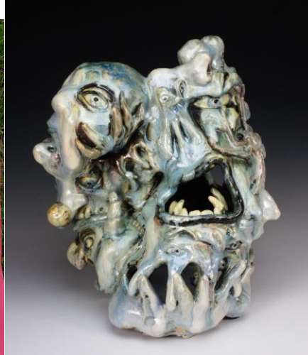
Fears , Harry Malesovas, 2020, Ceramic and Glaze

After formulating a drawing on paper, I take successful elements from the composition to build with clay. I often do not incorporate all figures seen in my drawings because some do not look the same when they are translated from 2D to 3D. There is also an inability to add as many elements as desired into a sculpture as opposed to a drawing because weight restrictions affect the ability of the sculpture to support itself. This transformation from 2D to 3D can be seen in my work, My Fears in Clay . However, using a process called mishima in which one carves into a clay form and fill it with glaze, I am able to replicate parts of the 2D work on my sculptures. This can be seen below in the mask titled, Mask of the Serpent .