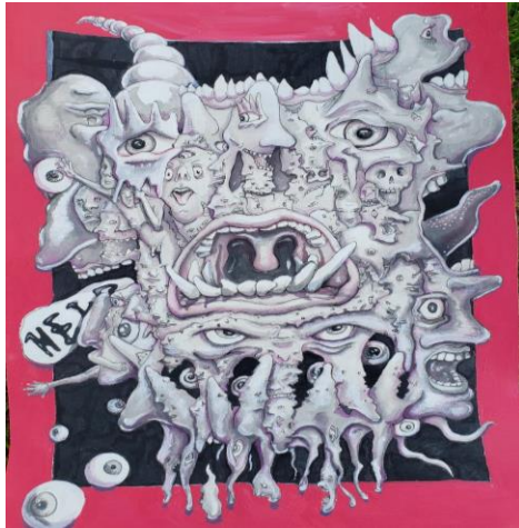
Fears , Harry Malesovas, 2020, Acrylic and Printer Ink, Artist's own image