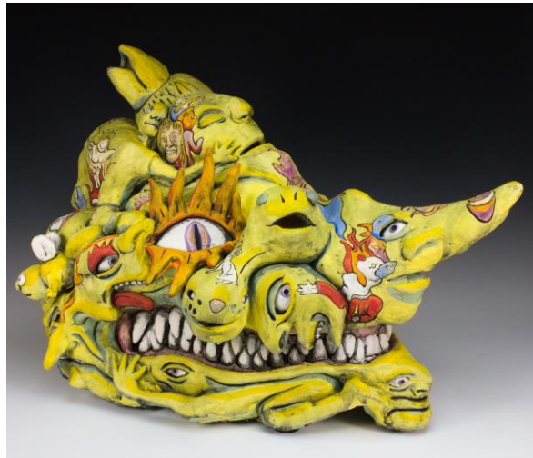
Legion, Harry Malesovas, 2020, Ceramic, Artist's own image