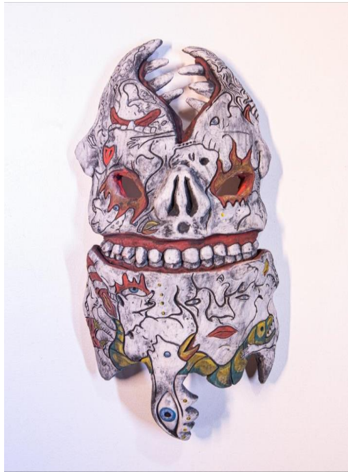
Mask of the Serpent , Harry Malesovas, 2020, Ceramic

After formulating a drawing on paper, I take successful elements from the composition to build with clay. I often do not incorporate all figures seen in my drawings because some do not look the same when they are translated from 2D to 3D. There is also an inability to add as many elements as desired into a sculpture as opposed to a drawing because weight restrictions affect the ability of the sculpture to support itself. This transformation from 2D to 3D can be seen in my work, My Fears in Clay . However, using a process called mishima in which one carves into a clay form and fill it with glaze, I am able to replicate parts of the 2D work on my sculptures. This can be seen below in the mask titled, Mask of the Serpent .