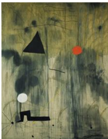
Figure 2. “Birth of the World”, Miro,Joan. 1935.

https://www.moma.org/learn/moma_learning/joan-miro-the-birth-of-the-world/