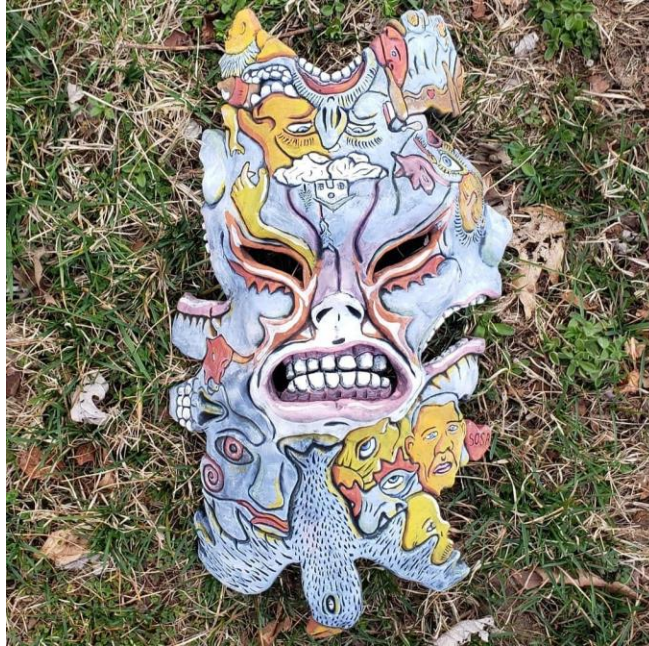
“Can't Live With Em, Can't Live Without Em”, Harry Malesovas, 2021, Ceramic, Artist's own image