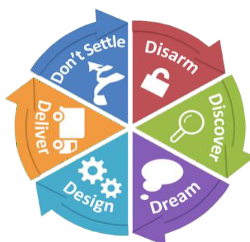
Figure 1. Appreciative Advising